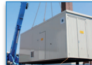
CONTAINER STEAM SYSTEM Completely equipped and ready to operate