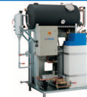
CVE Supply unit as complete ready-to-operate boiler housing installation In addition: Water softening equipment, measuring equipment