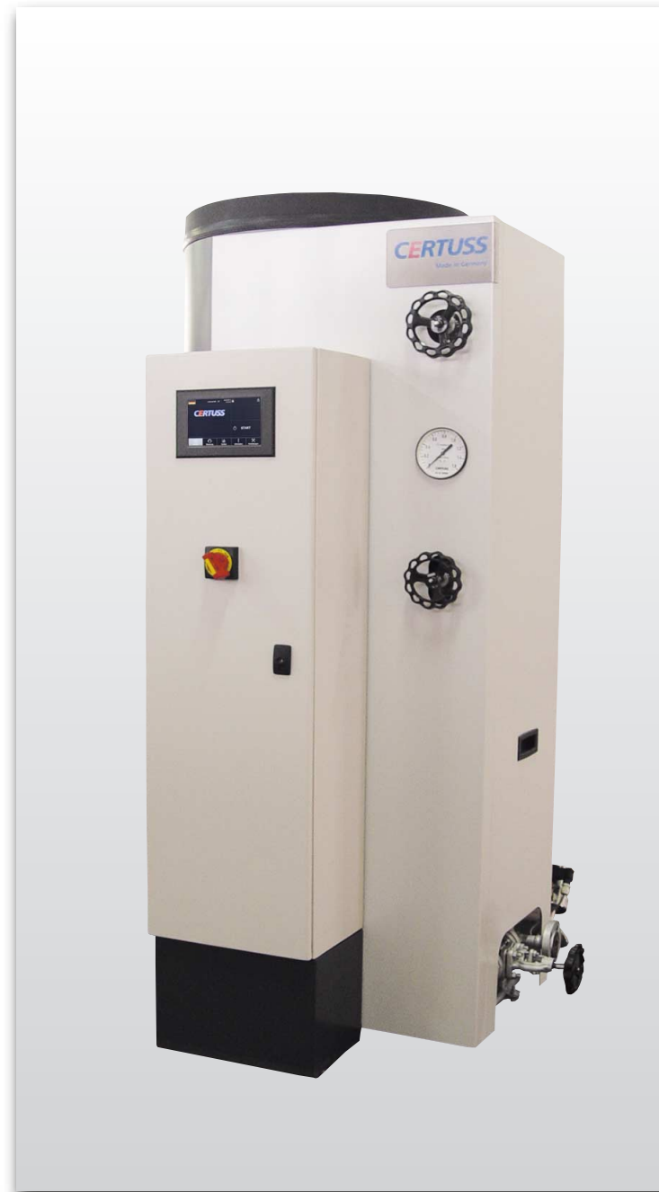
Steam generators UNIVERSAL TC series