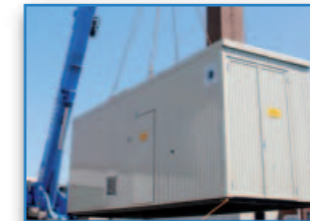
CONTAINER Steam System Completely equipped and ready to operate