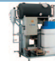
CVE Supply unit as complete ready-to-operate boiler housing installation In addition: Water softening equipment, measuring equipment