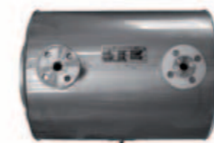
CERTUSS EXHAUST GAS HEAT EXCHANGERS CERTECON for Junior 80 – 400 as well as CERTECON and ECO SPI for Universal 500 – 2000