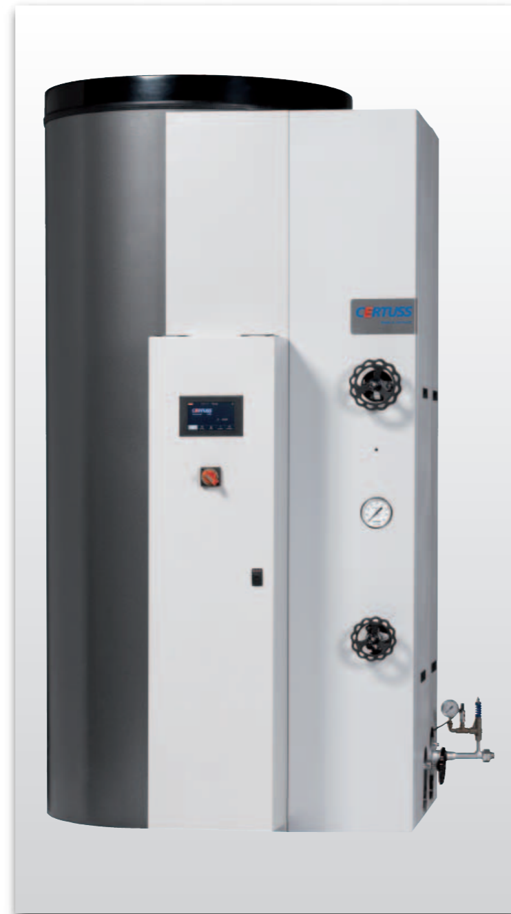
Steam generators JUNIOR TC series